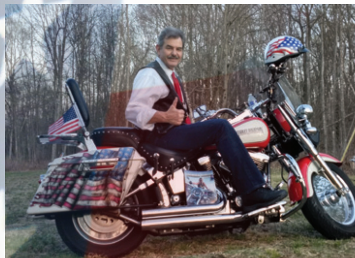
My Fellow Patriots and Riders