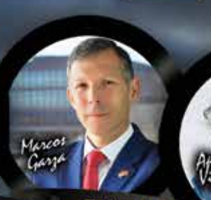
THUNDER ROADS® TENNESSEE & KENTUCKY