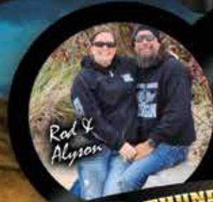
THUNDER ROADS® MICHIGAN