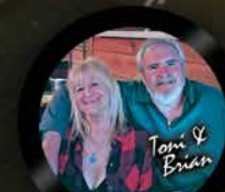
THUNDER ROADS® NATIONAL FOUNDERS

The Owner/Publishers Of Thunder Roads® Network Just Fought Their Way Through A World Pandemic And Emerged Shredded. But Victorious! Come Join Our Team. Life Is Nothing Shy Of Unpredictable. And Only You Can Decide What You'll Be Succeeding At And Thoroughly Enjoying. For Your Future. Come Work Hard And Play Harder With All Of Us At Team Thunder!