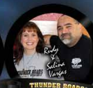
THUNDER ROADS® INDIANA & N. ILLINOIS