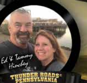
THUNDER ROADS® PENNSYLVANIA