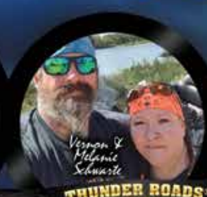
THUNDER ROADS® IOWA