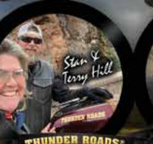
THUNDER ROADS® N. CALIFORNIA