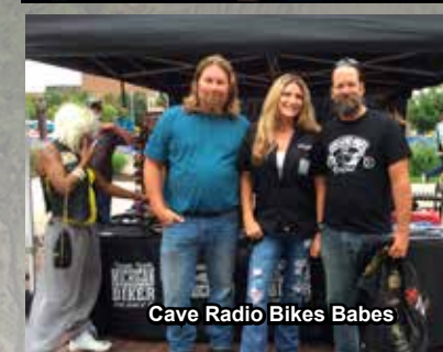
Cave Radio Bikes Babes