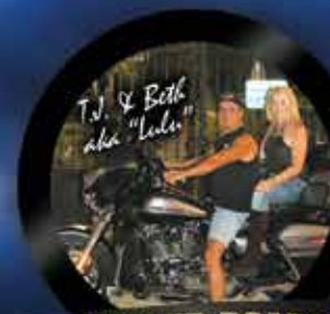
THUNDER ROADS® FLORIDA