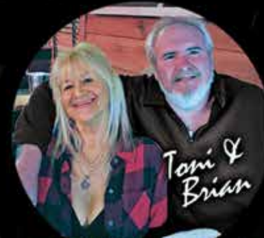
THUNDER ROADS® NATIONAL FOUNDERS

FOR LETTING US BE A VITAL PART OF YOUR RALLIES, RUNS & BIKE NIGHTS FOR THE LAST 24 YEARS & FOR MANY MORE YEARS DOWN THE ROAD!