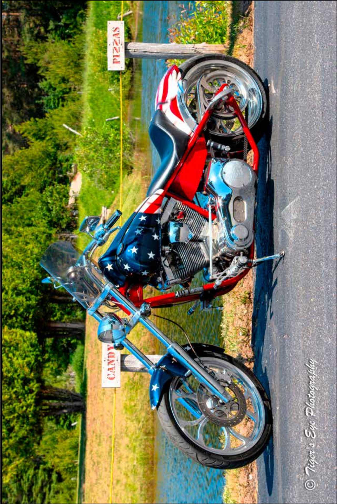
BIKE OWNER: SCOTT LANE | 2003 BIG DOG, PITBULL 107 S&S