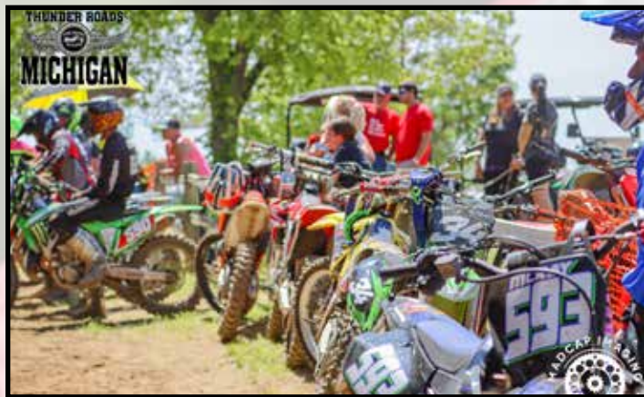
Memorial weekend at the racetrack!