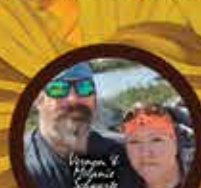
THUNDER ROADS® IOWA