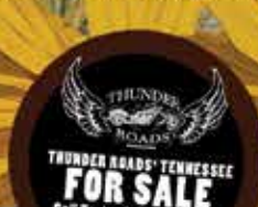
THUNDER ROADS® TENNESSEE