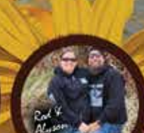
THUNDER ROADS® MICHIGAN