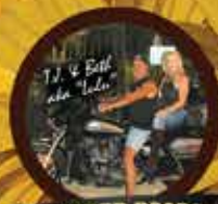
THUNDER ROADS® FLORIDA

Come Be A Part Of An Authentic Team That Works Together To Produce Their Own Edition Each & Every Month. There's Strength In Numbers... We Have The Longevity And The Numbers!