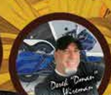
THUNDER ROADS® INDIANA & N. ILLINOIS