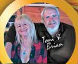
THUNDER ROADS® NATIONAL FOUNDERS