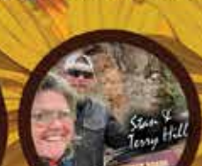
THUNDER ROADS® N. CALIFORNIA